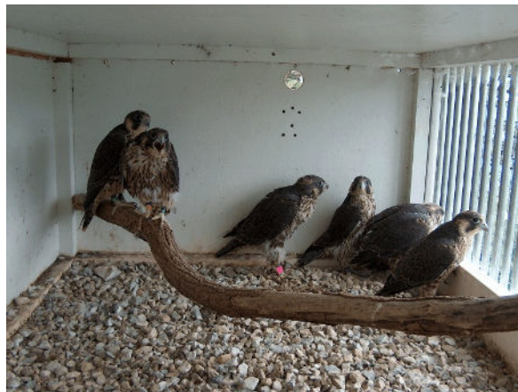
Peregrines in hack box 2 ready for release in June 2008.

A very special thank you to Greg Phillips - NERI for his help with web cams and peregrine satellite tracking.