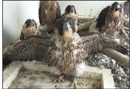
Group 2 – June 23

The third group was comprised of a single falcon that was successfully reared by two peregrine falcons nesting on the Walt Whitman Bridge in NJ. Based on communication with the United States Fish and Wildlife Service personnel in NJ, the nesting peregrines produced two offspring. However, only one of the eyasses successfully took flight. The other eyas attempted flight and landed along the rocky shoreline, which resulted in minor injuries to the young