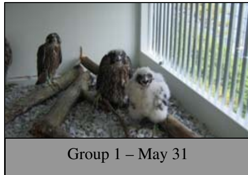
Group 1 – May 31

On the morning of June 15, over one dozen feeder quail were dispersed on the ground outside of the hack box and the door was engineered to open from a concealed location over 100ft from the site. WVDNR personnel, staff from Three Rivers Avian Center, and NPS biologists were on site during the release. At 1041hrs the box door was opened and within 15 minutes one bird (L green; R black 07/green W) had taken flight. At 1125hrs the last eyas (R purple; L black 17/green V) emerged from the box. The four eyasses around the hack box fed upon the feeder quail and explored the adjacent cliffline on foot before beginning to individually take flight at 1530hrs. All four eyasses were observed successfully landing in trees within the PFA until observations concluded at 2000hrs. The following day all the eyasses were accounted for in flight and roosting within the PFA. Daily observations of the PFA by WVDNR personnel, staff from Three Rivers Avian Center, volunteers and NPS staff tracked the progression of the eyasses development. Generally, activity was divided among four categories: feeding, roosting, soaring, and chasing. The bulk of their activity was spent roosting and flying in proximity to the hack box during the initial few weeks and later progressed to roosting upriver out of sight of the hack box and extended flights within the gorge. All six released eyasses dispersed successfully with a median and average duration of stay within the PFA of 33.5 and 37.83 days, respectively.