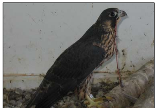
Group 3 – July 17