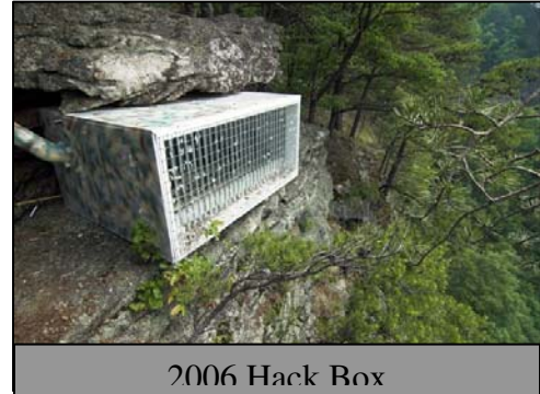
2006 Hack Box

The hack box was built using dimensions taken from the site and schematics from Sherrod et al. (1982). The box floor was lined with pebbles and wood debris to facilitate talon dexterity development and to elevate the eyasses from waste. The box was temporarily attached to the cliff face at a secluded location.