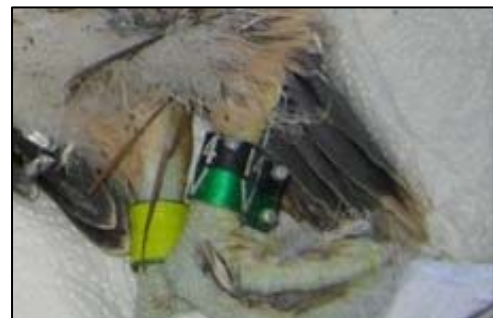
Alphanumeric and color taped U.S. Fish and Wildlife Service leg bands

Success was defined as dispersal after spending \geq 14 days following release within the general hack area or postfledging area (PFA). Conversely, we considered hacking unsuccessful if the individual died before release or dispersed prematurely < 14 days after release (Powell et al. 2002, Dzialak et al. 2006). From June through August, three staggered releases involving 15 eyasses were completed. The average release cohort was five individuals ( n=1-8 ).