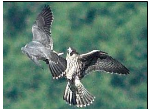
Playful Flight Interaction