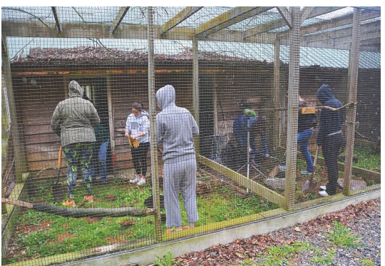
WVU Tech Biology Club students help maintain the mews for our Educational Ambassadors.

pril was volunteer month at TRAC, and Spring Cleaning was done more thoroughly than ever! First, Nate Morey and Mike Segars of Sylvan Traditions came in to remove a pine tree that was overshadowing Hoolie's new cage. Within a few hours, no evidence of the scraggly old pine tree remained, but there was a great brush pile for the wildlife to hide in at the edge of the woods. Next, a cleaning crew led by Lynn Turlin jobbed in to completely clean the TRAC Hospital from top to bottom, including all the cages and floor mats that we use in the indoor rooms. Many thanks to the crew: Lynn Turlin, Louise Bishop, Kevin Kinzer, Dayton Meadows, Carlene Barnes, Vickie Rave and Sam Richmond! That's the most thorough cleaning the building has had at one time since it was built in 2001!! Next up, and not to be outdone, the Biology Club from WVU Tech came in at the